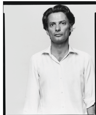
Richard Avedon, photographer, New York, July 23, 1969

Don't miss this stunning exhibit – on until 17 November.