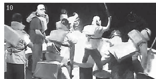
Footage from the Mavi Marmara security cameras shows the activists on board as they prepare to attack incoming IDF soldiers on 31 May 2010.