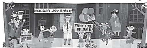
The Google Doodle honouring Jonas Salk.

The late Jewish American researcher Jonas Salk, who discovered the polio vaccine, was honoured on 28 October with a 'Google Doodle' for what would have been his 100th birthday. Before the polio vaccine was introduced in 1957, many children became paralysed as a result of the illness.