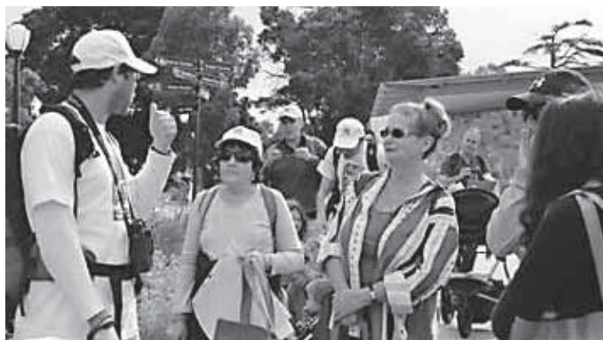
JNF WA Nature Club – ready to follow the leader.