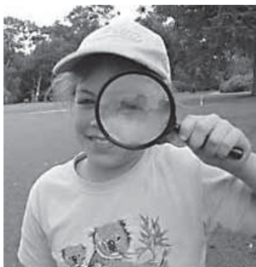
Getting a closer look at nature.

DIARISE SUNDAY EVENING 9 NOVEMBER 2014 TO ATTEND JNF'S SPECIAL ANNUAL EVENT.