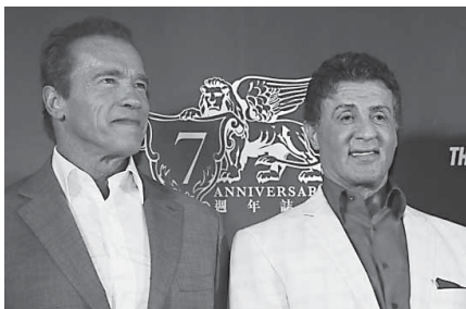
Arnie and Sly say "no" to Hamas

Actors Penelope Cruz and Javier Bardem accused Israel of "genocide," and singers Rihanna and Selena Gomez also tweeted support for the Palestinians. Cruz and Bardem later clarified their position, and Rihanna deleted her tweet.