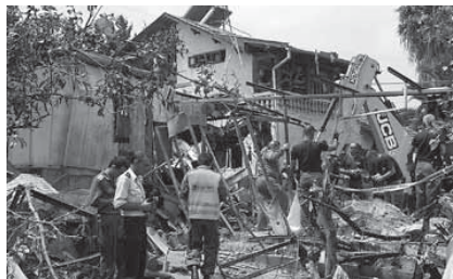
Home struck near Ben Gurion Airport

Bloomberg said the trip was a gesture of support for the Jewish state. Speaking before boarding an El Al flight at New York City's JFK airport, Bloomberg said, "Israel has a right to defend its people, and they're doing exactly what they should be doing."